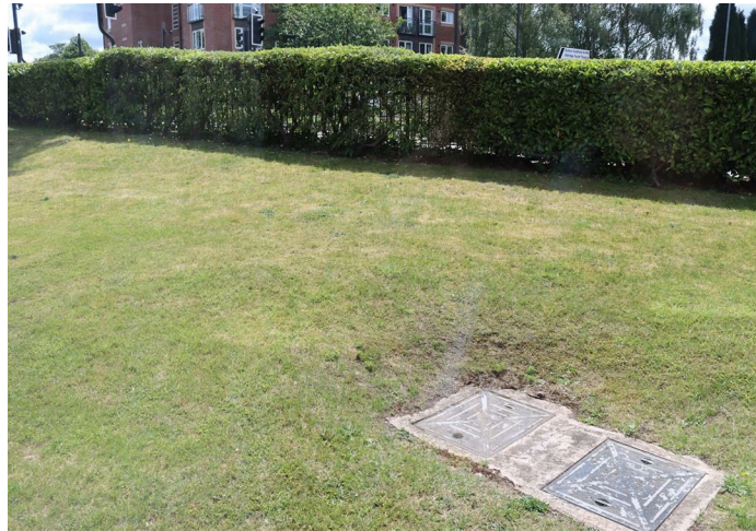
View From Lounge