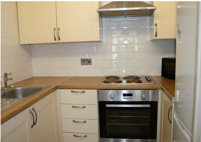
Modern Fitted Kitchen