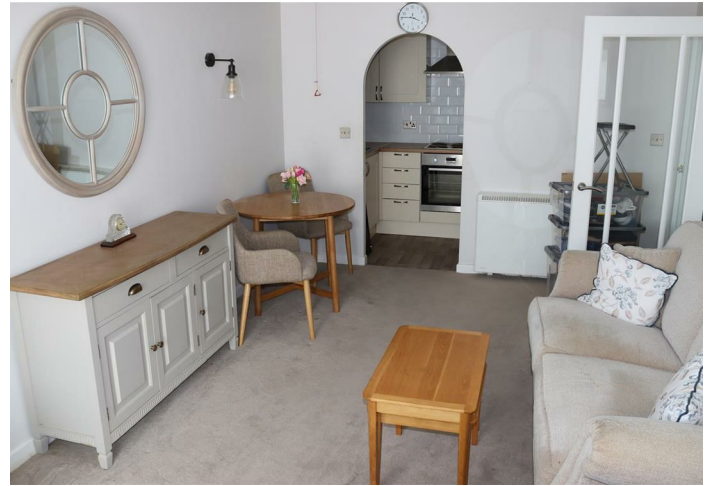
Lounge / Dining Room