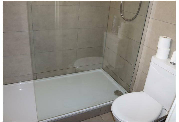
Modern Shower Room